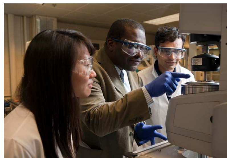
INDSAY FRANCE / CORNELL LINIVERSITY